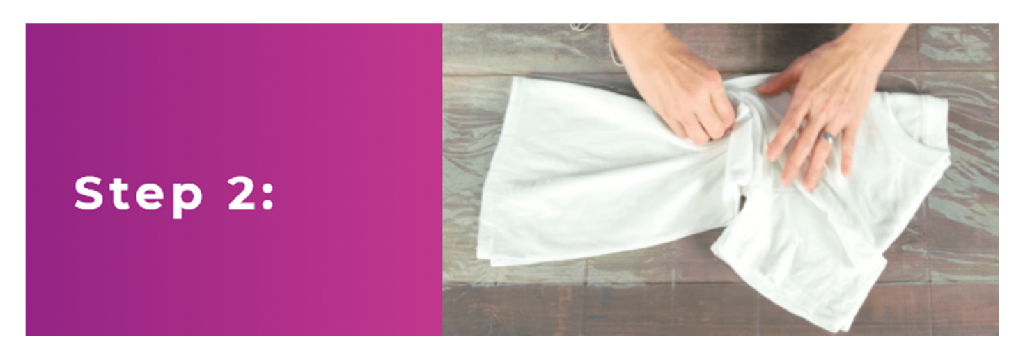
Pinch shirt where you would like the centre of your first spiral to be, then twist fabric a few times to create a small spiral.