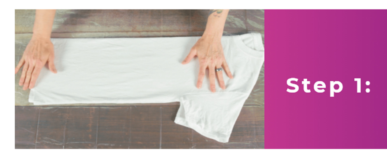
Fold damp shirt in half lengthwise and press flat on tabletop.