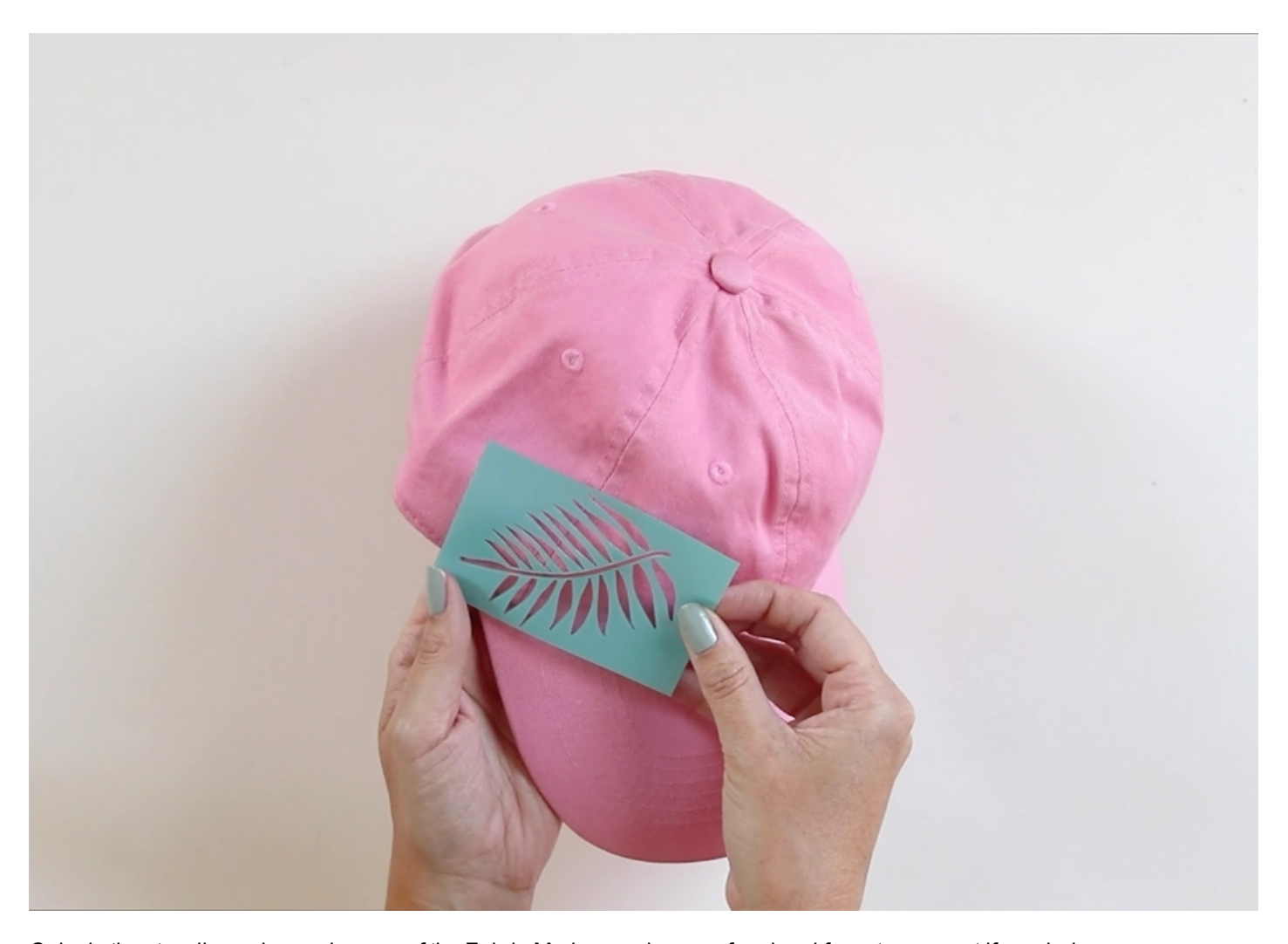
Color in the stencil openings using one of the Fabric Markers, using your free hand for extra support if needed.