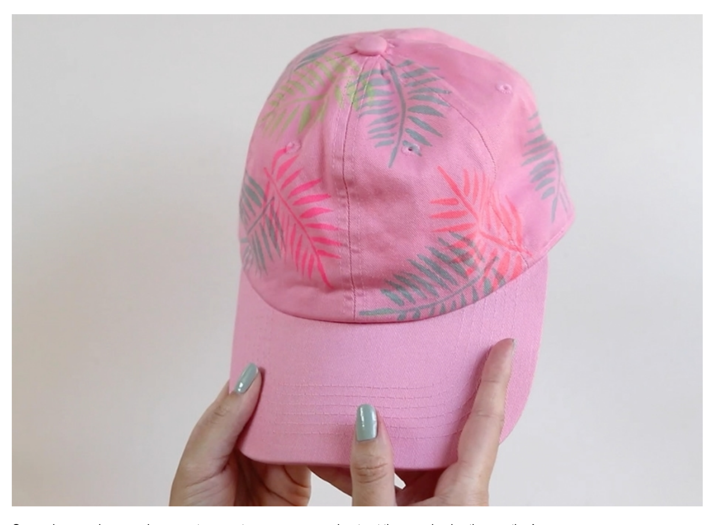
Sunny days are here again - so put your cute new cap on and get out there and enjoy the weather!